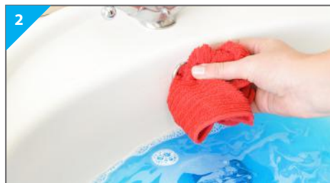
2 Block the overflow hole with a wet cloth. By doing this you are creating a vacuum which makes plunging a lot more effective.