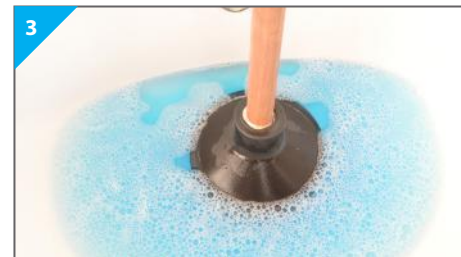
3 Next, create a tight seal by firmly placing the plunger over the open drain. Fill the bath or sink so that the water reaches halfway up the plunger's rubber cup.