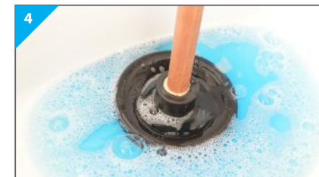
4 Push the plunger up, then down without breaking the seal. Repeat this push-pull action a number of times.