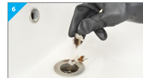
6 Still no luck using the plunger? Try using a plumber's snake. If the water drains, the block is cleared and you should be able to remove the debris. If the drain is still blocked your next step is to get a good drain cleaner.

Warning: Avoid plunging a drain after using a hazardous chemical. If you do so, run water down the drain first to wash away any chemical residue. Always wear safety glasses.