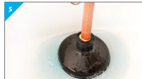
5 Break the seal of the plunger with one final pull. If the water doesn't drain, the debris is still blocking the drain. Try repeating steps 3 and 4.